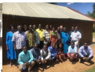
Some of the LNI Leaders