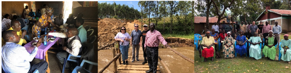
LNI leaders enjoying lunch On our way to a Project One of our Micro Finance Groups

We had the joy of visiting some of the Social Justice Projects funded by JCM in Kenya. We work closely with key leaders who oversee our Micro Finance Projects , training and serving those who are beneficiaries of our programmes. We operate through Co-operatives, i.e. groups of people, and JCM is privileged to have helped between 400 - 500 people start their own businesses. Some raise chickens, some are seamstresses, some have roadside stalls, others raise cows. There are a variety of activities which these creative and innovative Kenyans carry out in order to become self-sufficient, plus bless the wider communities.