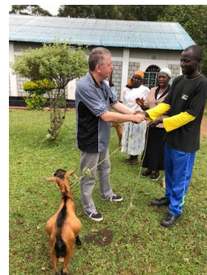
Giving goats to happy recipients