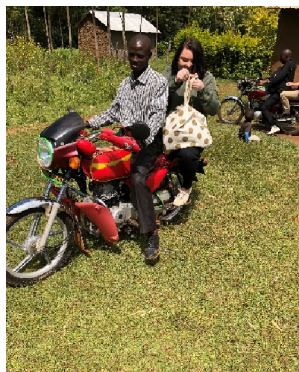
Ready to travel