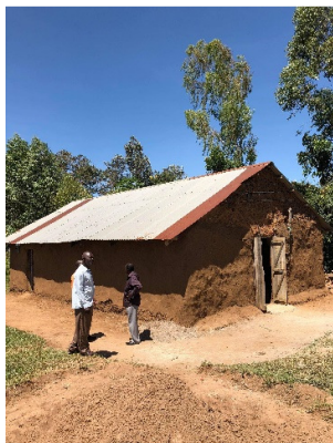
Local church building