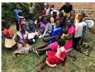
Very happy locals